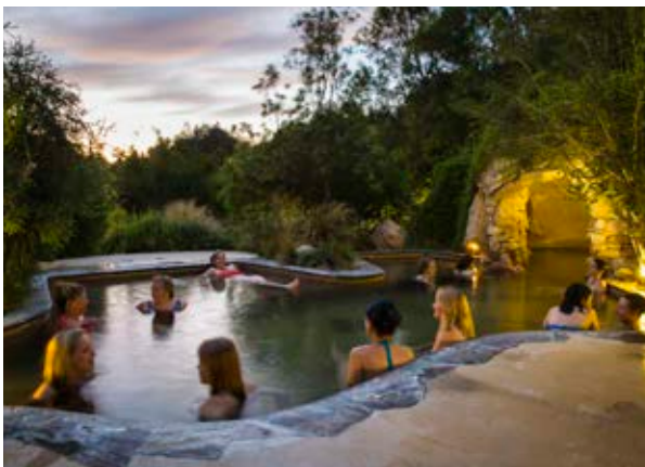
Peninsula Hot Springs has plans to add 16 new pools and other features

Open since 2005, Peninsula Hot Springs' bathing experiences currently include the