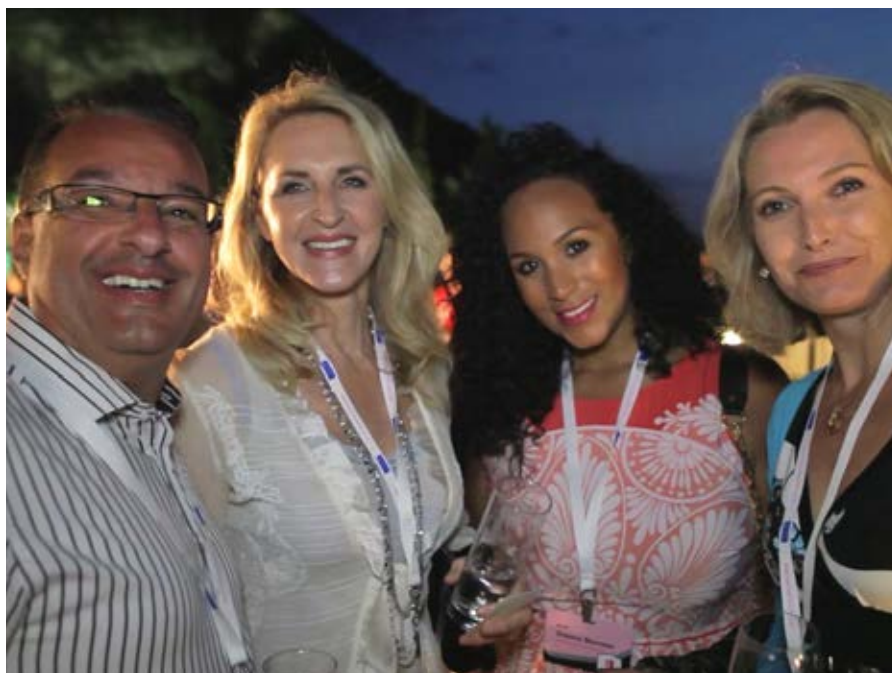
Attendees at a previous Spatec Europe enjoying networking opportunities