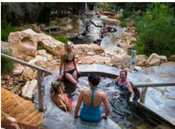
Peninsula Hot Springs will have 57 pools after the expansion

Davidson is also working with several groups in the area that are interested in starting hot springs in order to create the Mornington Peninsula hot springs region, similar to the Rotorua hot springs district in New Zealand, where Davidson was involved with the master planning. "The concept in Rotorua and in our region is to offer the full range of hot springs