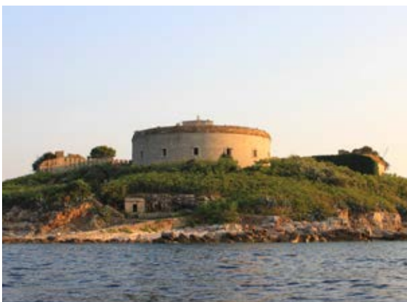
The fortress was occupied by Italian forces under Mussolini

"The original idea was to completely preserve the existing exterior, known as one of the biggest and best preserved fortifications on the Adriatic Sea, and also as one of the most impressive Austrian architecture landmarks of Montenegro," said the architects in a statement. The project has been developed