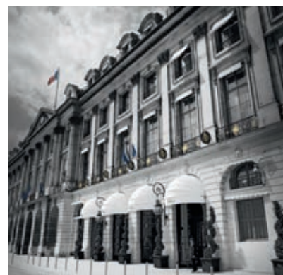
The Ritz Paris has been closed for renovations