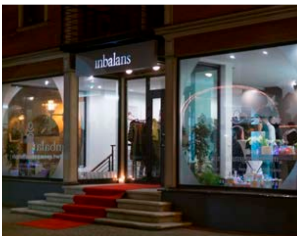
The Inbalans comfort zone space is in the Latvian capital of Riga

This is the first branded comfort zone space, and features two treatment rooms spread over two floors, dedicated to the Italian skincare brand – one for facial care and another large room with a shower for full body treatments. Part of comfort zone's programme includes