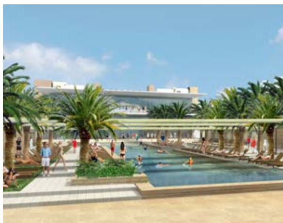
Water features will cascade from the Grand Lobby to the spa

The spa is envisioned as a sanctuary dedicated to health and wellbeing, centred around the last two pools of the oasis meander, and is separated from the rest of the resort by a mature citrus grove, which will grow seasonal produce for the on-site restaurants. The wellness programme will