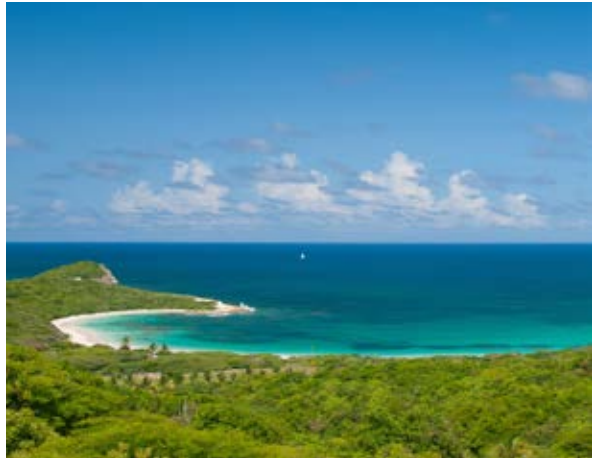
Half Moon Bay Resort has stood vacant since 1995's Hurricane Luis

Replay has completed preliminary planning for the new Half Moon Bay Resort, which includes an internationally-branded luxury