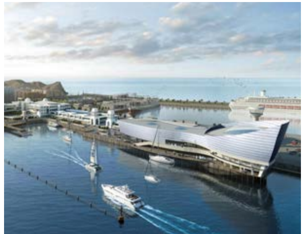
The project will be a tourism and cultural gateway for Muscat

The state-owned Oman Tourism Development Company (Oman) will establish a new company to develop the OMR500m (US$1.3bn, £917.7m, €1.19bn) waterfront scheme – which it says will "set new standards for authentic waterfront destinations in the region" – on a 101 hectare site in the