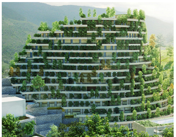
The forest-inspired hotel is designed by Italian architect Stefano Boeri

The group has unveiled renderings of the pair's design for a striking “lifestyle destination” with trees on every terrace. The building will feature a 182-bedroom Cachet Resort Hotel and a 71-bedroom URBN hotel, two restaurants and lounges, a swimming pool, spa and fully equipped fitness centre. The Wanfeng Valley resort is being developed across 49.4 acres (199,915sq m) in the Xingyi City by its owner, the Guizhou Wanfeng Valley Ecological Cultural & Tourism Development Company. It will be located close to major shopping, dining, convention and entertainment outlets, the