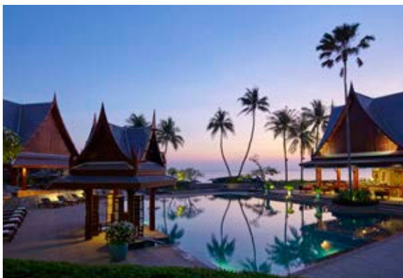
The new retreats are designed to address specific health issues

In creating the retreats, Chiva-Som's health and wellness team takes into account the latest research and a review of the most effective programmes and treatments, the company said.