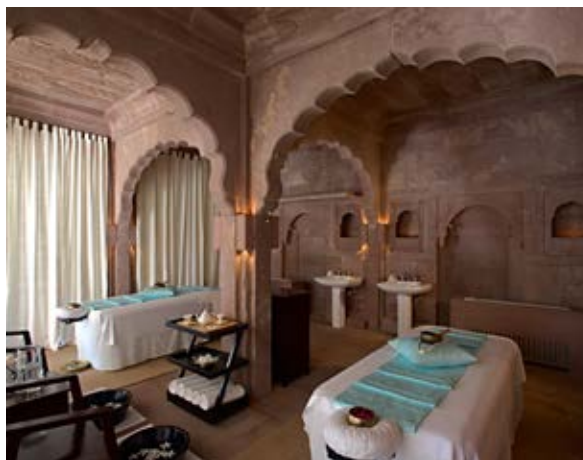
The first ila only spa, launched in 2014, is at Raas Jodhpur in India