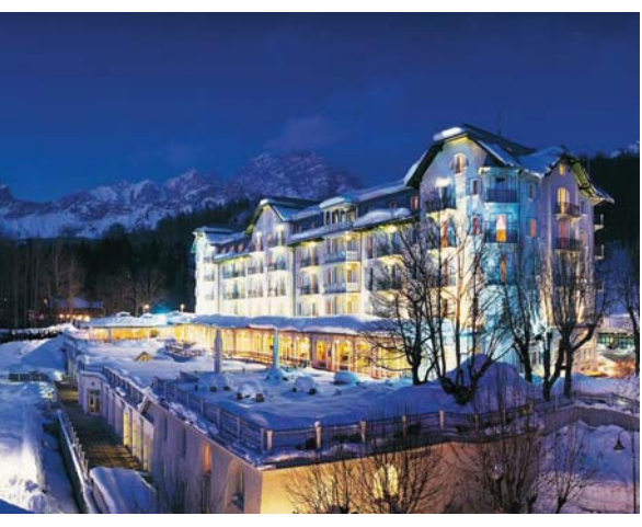
As part of the plans, Marriott added its first ski resort to its collection

As part of the expansion plans, the Luxury Collection brand is scheduled to debut in three new countries this year, as well as open its first ski resorts - the Cristallo, a Luxury Collection Resort & Spa in Cortina, Italy and Hotel Talisa, a Luxury Collection Resort in Vail, Colorado. Both resorts will feature large spas.