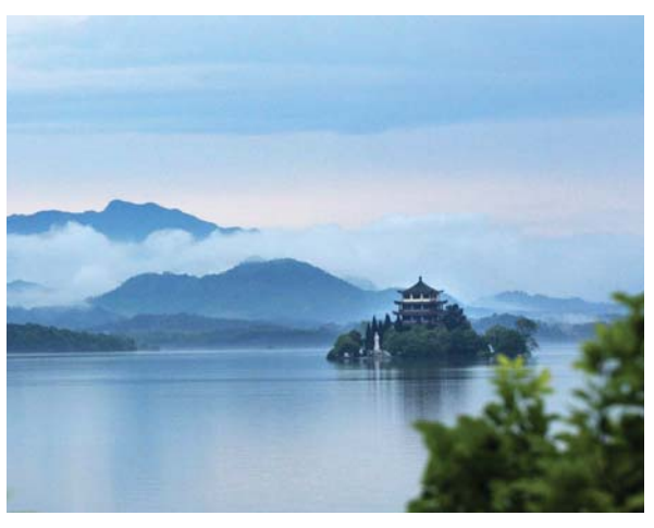
The Wanfo Lake in Anhui Province is famous for its natural beauty

The natural springs will be complemented by Dusit's own Devarana Spa, delivering Thai-inspired treatments in four luxuriously