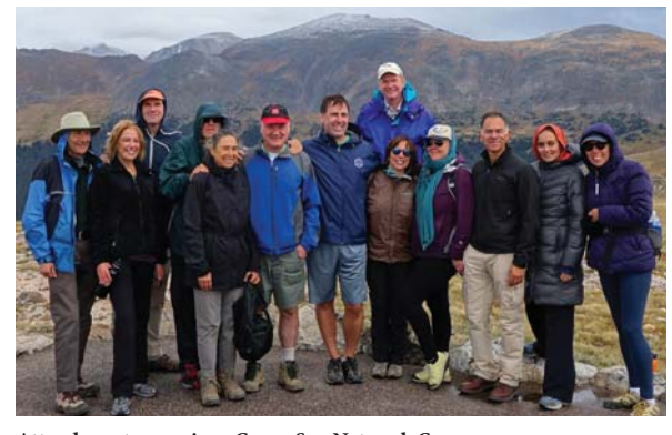
Attendees at a previous Green Spa Network Congress

"You will be inspired to live your best life, recapture your youthful joy, and align your