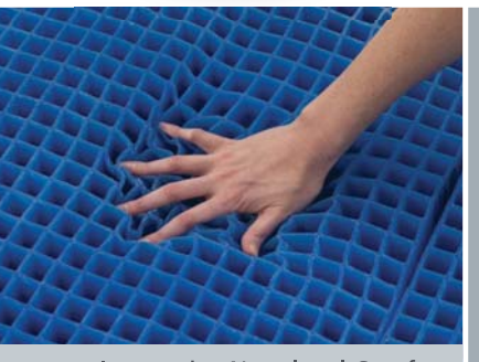
Innovative Next-level Comfort 5" and 7" Strata GT™ SpaMattress options with 2.5" gel layer

Make a statement! The innovative multipurpose treatment table takes client comfort, therapist ergonomics, and wireless technology to the next level. Coming now to award-winning spas, worldwide.