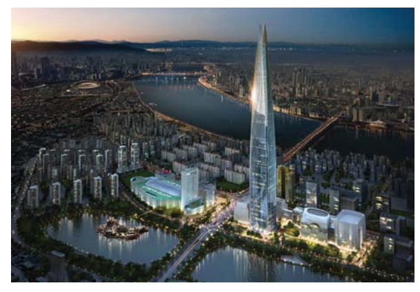
Lotte World Tower is the sixth tallest building in the world

Most of the treatment rooms feature views out over the city, said Saussay, and that vantage