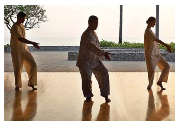
Chiva-Som is dedicated to revitalising the mind, body and spirit

An on-site organic farm will be part of the project, and visitors can learn and participate in organic farming, as well as enjoy farm-to-table dining. A marine park will house more than 70 species of marine life, and will provide additional activities and entertainment,