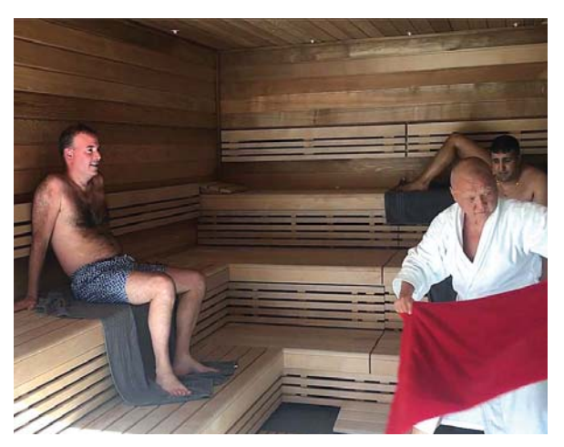
The ritual is meant to revive guests both mentally and physically

"The meister of aufguss is not there merely to show off what he can do technically, but to provide the audience with a relaxing, stimulating and refreshing experience both physically and mentally."