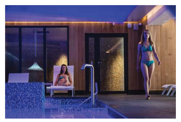
The centre was designed by the Claude Correia architecture agency

The first floor hosts ten treatment cabins and a rejuvenation room, as well as the