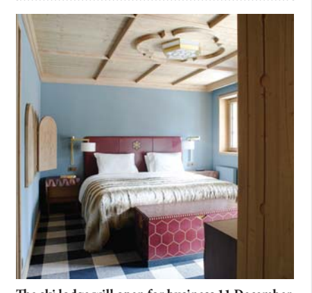
The ski lodge will open for business 11 December Oetker Collection to open spa

The full interviews are available in the Q3 2013 edition of Spa Business magazine. Details: http://lei.sr?a=G9Q3a