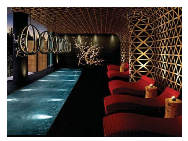
The spa will be the first in Romania to be operated by a global brand

Shiseido Spa will include therapy suites, an energy pool, relaxation spaces, a hammam, sauna and steamrooms, sundeck and a hair and beauty salon, as well as a pilates and yoga studio. The spa will have a strong focus on catering to male guests with dedicated spaces for male grooming.