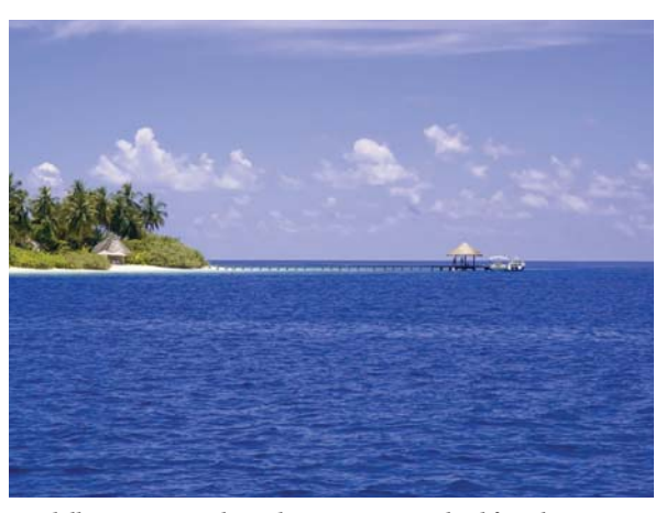
Kandolhu was previously used as an excursion island for other resorts

The resort will have 30 villas in five different styles, with either direct beach access or clear views of the Indian Ocean. Also included are