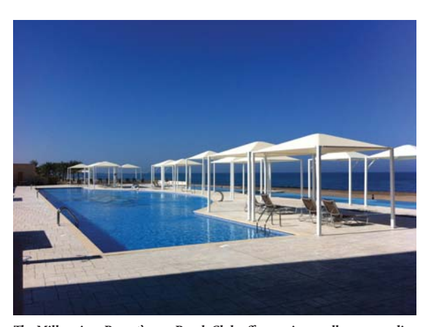
The Millennium Resort's new Beach Club offers various wellness remedies

The Beach Club has also been fitted with a gym using Technogym equipment and a kid's club, Azur Middle Eastern restaurant and Shisha Lounge.