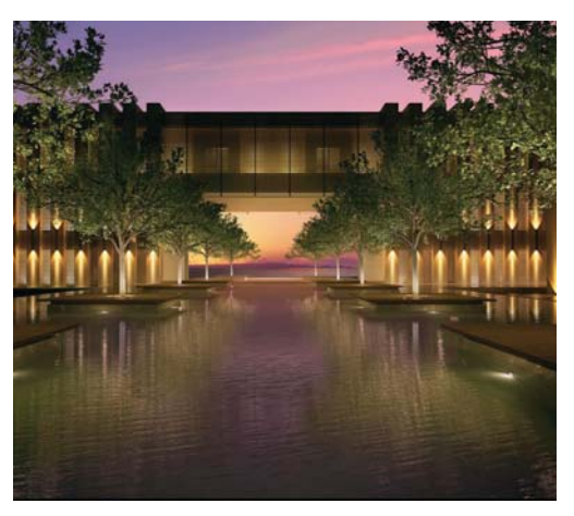
The 30,000sq ft spa has nine treatment rooms and facilities

strong and subtle water pressures. Facilities include an aromatic steamroom, experience showers with chromatherapy, a sauna, an ice fountain with cool mist shower, vitality pool with hydrotherapy elements, a cold plunge pool, solarium, thermic loungers, indoor