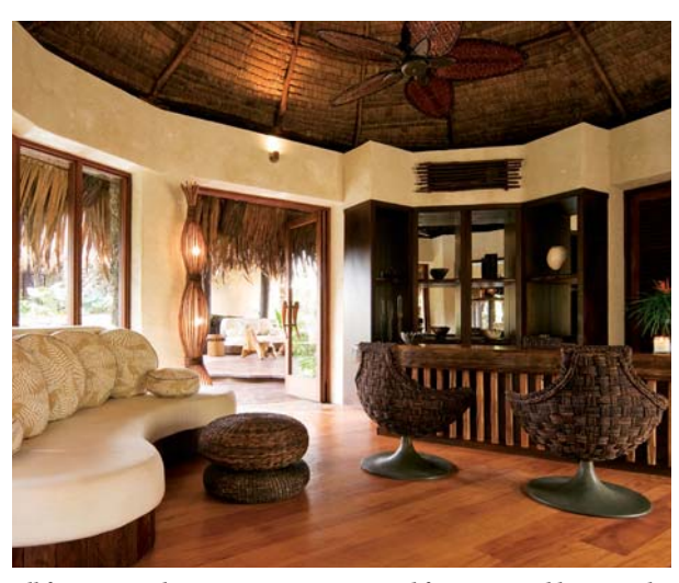
All furniture in the spa reception was created from sustainable materials

Guests are also encouraged to become involved in the Spa Garden, where an