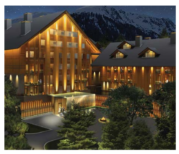
The project will see the construction of six luxury hotels in the Swiss Alps

The hotel will feature a 2,400sq m (25,833sq ft) spa and wellness centre with 10 trestment suites, a beauty salon and hair salon. Facilities at the spa include bio and Finnish saunas, organic sol steam bath, outdoor lap pool and a 35m indoor pool with views of the