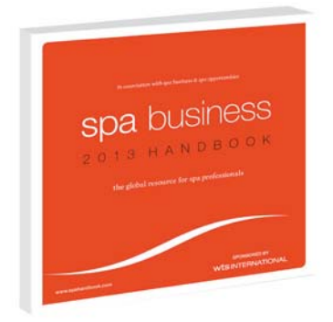
The Spa Business Handbook is available now

The So Sound Lounger is the company's flagship product, while a music-integrated treatment table, mattress and meditation programme are also available. Details: http://lei.sr?a=b3R4F