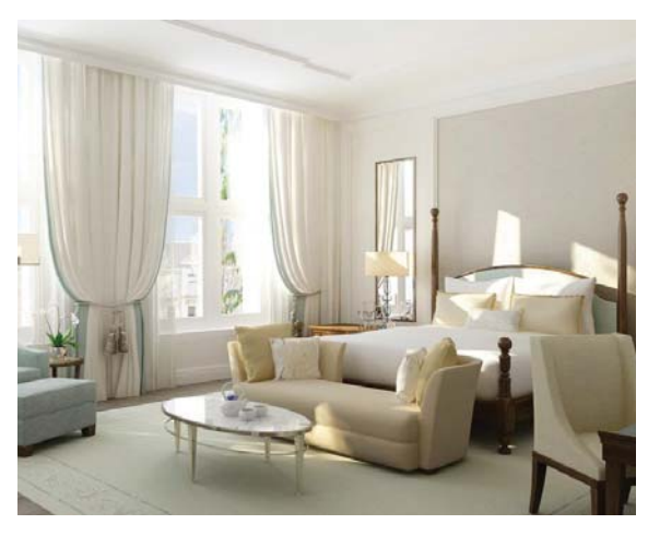
Royal Suite bedroom at the Waldorf Astoria Amsterdam

The group's new UAE property will open on Dubai's renowned Palm Jumeirah in 2014.