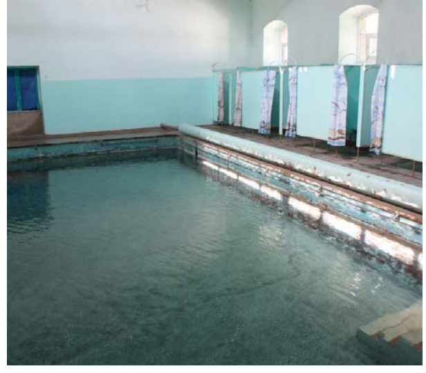
The thermal baths in Abastumani are in need of a significant revamp

Possible strategies include a rehabilitation centre for athletes or a Georgian version of