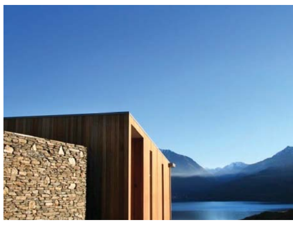
Guests visiting Aro Ha will bond through shared experiences

The purpose of the facility is to "create a place that supports self-awareness, physical