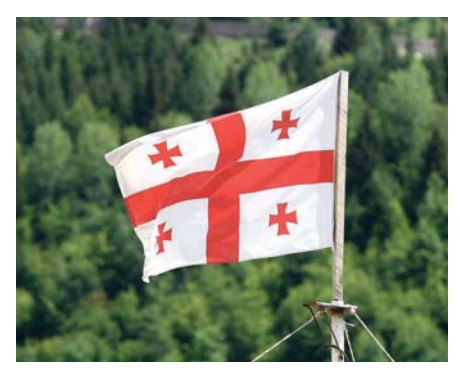
Georgia wants to become a wellness destination again

Georgia's clean air is a notable selling point with the small town of Abastumani being one of the country's oldest health destinations. Using the region's fresh air and its hyperthermic springs, rich in sulfate-sodium chloride, have been used as a method to reduce symptoms of