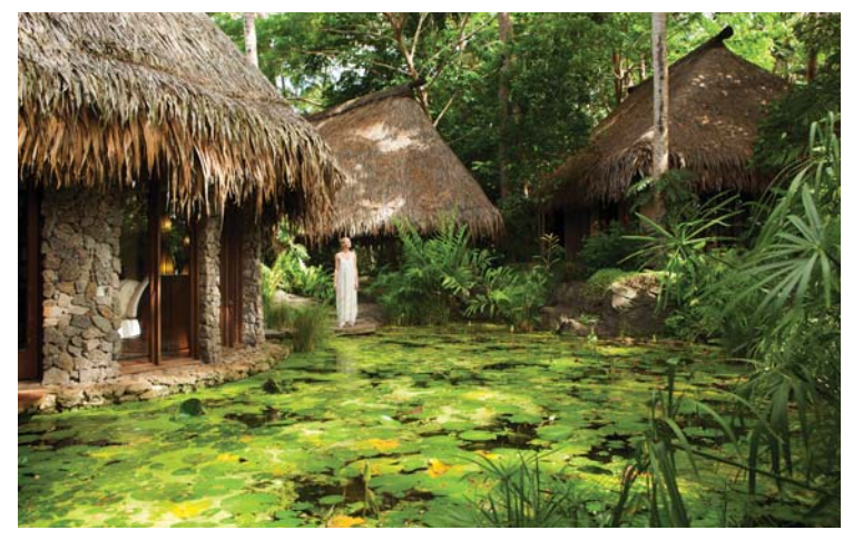
The four spa treatment villas are surrounded by tall palm trees and water features

A spa is at the centre of the Laucala experience, which comprises traditional Fijian therapies, organic amenities and serene settings. Four treatment villas - each with an outdoor hot tub, relaxation room and changing