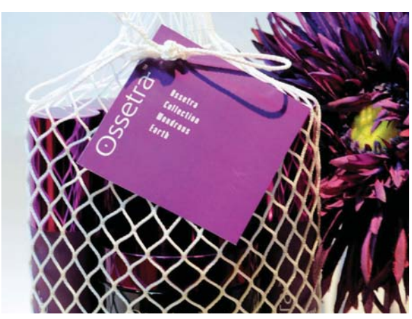
Ossetra is sustainably sourced to have limited environmental impact

The new contract will mean a large increase in production for the company, which previously only catered to smaller spas. The contract will now see IC Spa products distributed to 72 spas across Beijing, China, in a four-year supply deal. The Ossetra line was