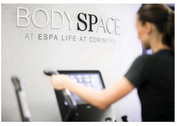
BodySPace combines fitness, nutrition, wellness and technology