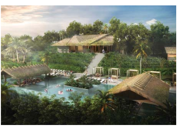
Chapman Taylor are creating the masterplan for the Eco-Resort

The architecture is inspired by the local history of Mui Dinh, particularly that of the Cham tribal culture - "drawing on a rich