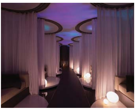
The Katara Beach Club will include separate male and female floors with gender-separated entrances

It will include separate male and female floors with gender-separated entrances, an Aurora Borealis light fixture in the relaxation