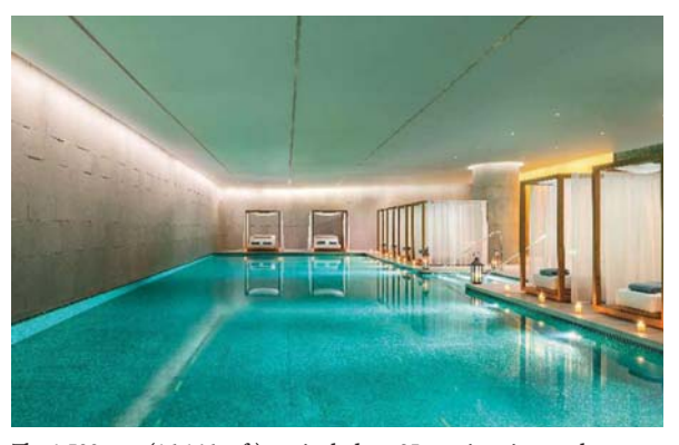
The 1,500sq m (16,146sq ft) spa includes a 25m swimming pool

"We very much enjoyed working closely with the highly experienced Bulgari team to