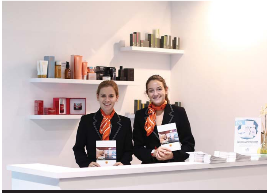
The Piscina event will include the "Wellness Experience" – a fully-functional wellness centre

Hong Kong Convention & Exhibition Centre The 22nd edition of Cosmoprof Asia will continue the formula of '1 Fair 2 Venues' and be held strategically across two venues. www.cosmoprof-asia.com