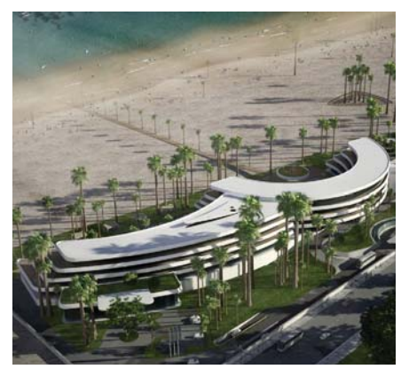
The 250-bedroom resort is expected to open in 2018

Expected to open in 2021, the 250-bedroom, beach-front resort will be marketed as a luxury spa resort, catering to a mix of leisure, government, corporate and MICE demand. The resort's unique selling point will be a large Avani Spa.