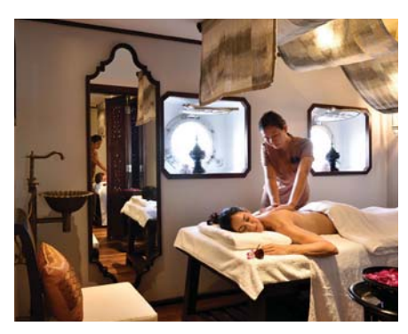
The hotels will have a focus on design and wellness

'The Bensley Collection' is billed as a portfolio of "super luxe hotels and resorts showcasing visionary concepts, extraordinary design and bespoke service", with Bensley granted "complete freedom to let his famed creative spirit run free". The debut property, called Shinta Mani Angkor – Bensley Collection, will open in December 2017 within the French Quarter of Siem Reap, 7km from the temple complex of Angkor Wat. It will feature ten villas inspired by traditional Khmer design, with each offering 156sq m of space across two pavilions.