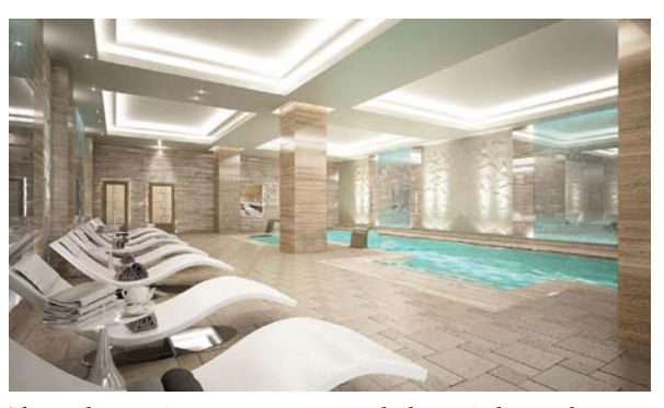
The spa houses six treatment rooms and a large vitality pool

Luxury hotel operator Kempinski is set to open its second property in the Baltic states during Q3, with the launch of a 141-bedroom spa hotel in Latvia's capital city Riga. The Grand Hotel Kempinski Riga will join Kempinski Hotel Cathedral Square in Vilnius, Lithuania, in its fledgling Baltic portfolio as the operator looks to benefit from the economic boom in the region.