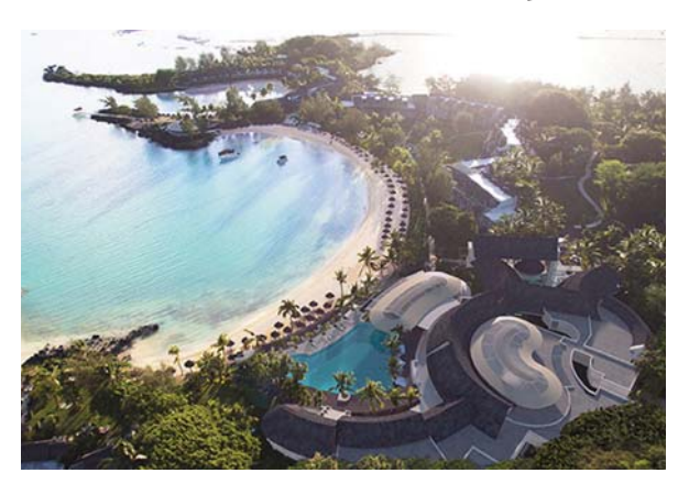
Lux Grand Gaube is located on the African island's north coast

His specialised programme, centred around balance and being mindful, offers a mind/body experience through guided meditations and stretch-based classes - as well as barre-style workouts and a new Pilates practice, Movement on the Roller, designed to work the entire body.