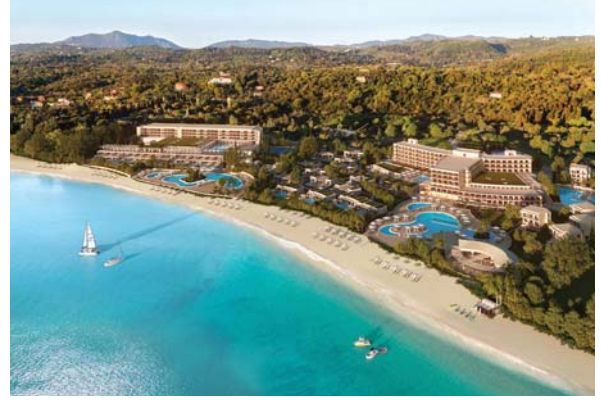
Ikos is establishing a chain of luxury spa resorts across Greece

The resort's spa will house seven private treatment rooms – including couples' suites – indoor/outdoor heated pools with spa pools;