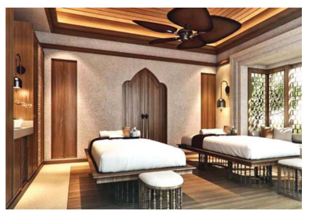
Spa facilities include eight treatment suites - including double suites

Guests will be able to experience the Songkran Shower, the signature pre-spa ritual inspired by the annual Songkran festival involving the throwing of water, as a prelude to selected spa treatments. Other resort facilities