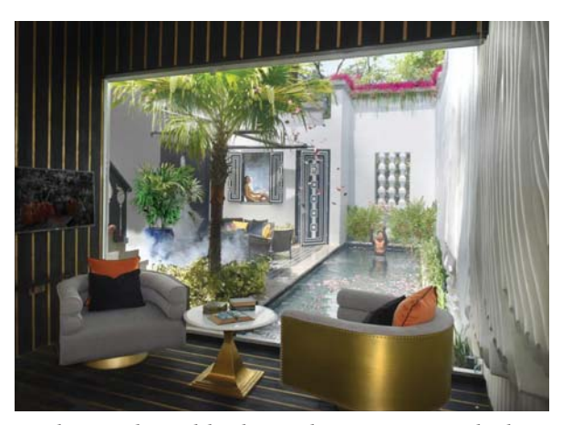
Bensley teamed up with hotel group Shinta Mani to create the chain

Restaurants will feature locally inspired food with ingredients foraged from the surrounding forests, while the Boulders Spa will be a full-service Khmer Spa featuring natural, chemical-free products by Khmer Tonics.